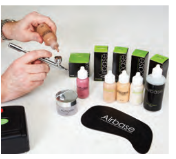
Custom blending foundation colours is easy with Airbase Make-Un

Most basic beauty make-up work requires matching the skin colour precisely.